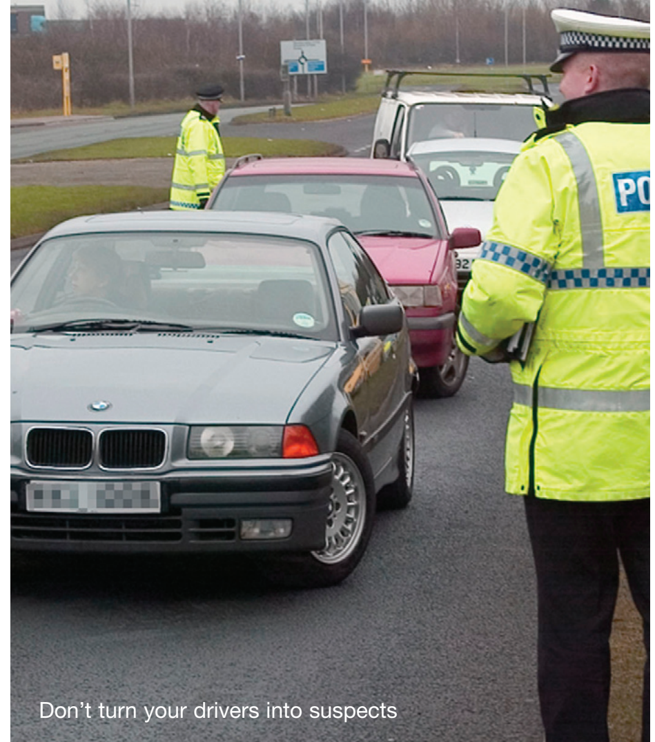
Don't turn your drivers into suspects

Defeating uninsured drivers will help limit the cost of your insurance, and make our roads safer